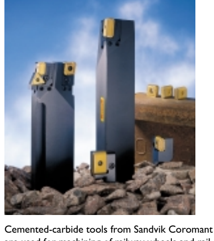
Cemented-carbide tools from Sandvik Coromant are used for machining of railway wheels and rail in Russia.

Sandvik Steel has built a reputation for quality, based on its niche products and its close cooperation with customers. The emphasis is on problemsolving. Important product and customer areas include steam-generator tubes used in the modernization of