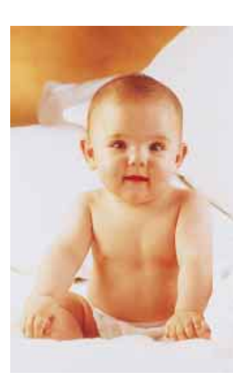
Focus on IT

When such disposable products as diapers, sanitary pads, panty liners, bandages and coffee filters are manufactured, they have to be cut to achieve their typical profiles. And the precision of the cut of a diaper, for example, must be perfect. To obtain good results and at the same time prolong the life of cutting tools, Sandvik Hard Materials has developed rotary knives made of cemented carbide. They meet customers' demands for precision, operating safety and durability up to 100 times more effectively than standard steel knives. For example, the cementedcarbide knives can cut materials as thin as 0.2 millimeters and at a speed of approximately 10 diapers per second. Talk about quick changes! •